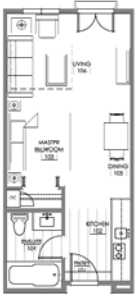
Chardonnay Studio Suite Square Feet: 447 Sleeps: 4