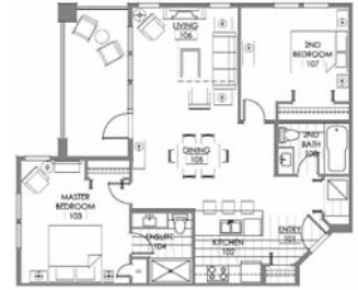
Gamay Two Bedroom Suite Square Feet: 1085 Sleeps: 6