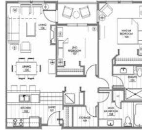
Shiraz Two Bedroom Suite Square Feet: 1038 Sleeps: 6