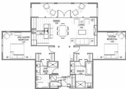
Sommelier Penthouse Suite Spectacular view of the Kobau Mountains Square Feet: 1351 Sleeps: 6-8