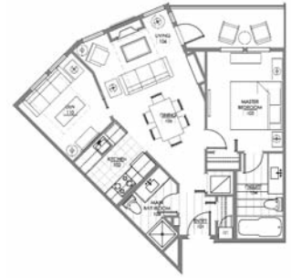
Pinot One Bedroom Suite Square Feet: 786 Sleeps: 6