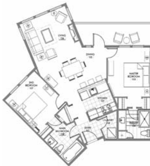
Merlot Two Bedroom Suite Square Feet: 1019 Sleeps: 6