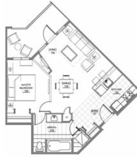
Semillon One Bedroom Suite Square Feet: 676 Sleeps: 4