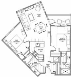
Cabernet Two Bedroom Suite Square Feet: 889 Sleeps: 6